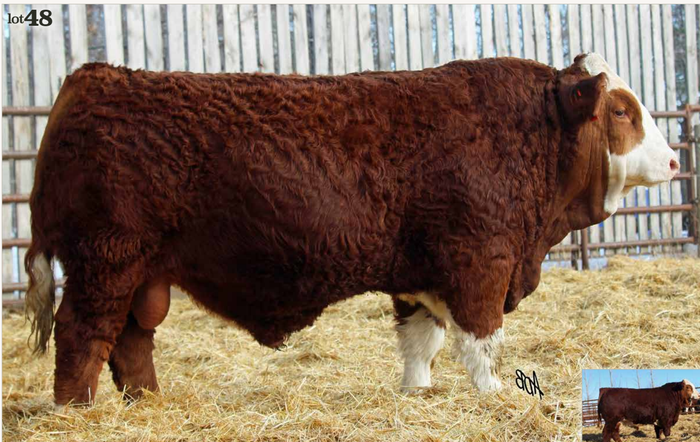
MARC 8E MATERNAL BROTHER TO LOT 48