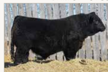
SPRINGCREEK DURAMAX 41E SIRE OF LOT 38