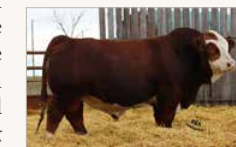
SILVERLAKE ROCKY 238C SIRE OF LOT 49

Polled Full Fleckvieh A moderate framed polled fleck bull with plenty of length and top, loads of quarter, and a nice dark color. A true all around sire backed with some of the most powerful sires and cow families in the breed today. 80H has that herd bull look. Material sib is working at Nick & Angela Bounday's.