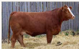
MARC 100D MATERNAL SISTER TO LOT 34