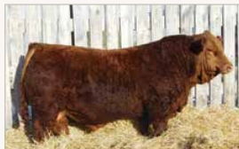
SVS TYCOON 841F SIRE OF LOT 34

Harpoon is a bull with lots of performance, extra capacity, a nice big foot, structurally correct, soggy, wide topped bull with that dark red hair coat. This powerful Tycoon son is no fluke as his dam is a full sister to MARC 100D which produced an $18,000 bull at Spring Creek Simmentals last spring! Big time herdsire here backed by a proven cow family.