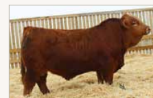
MARC 13F MATERNAL BROTHER TO LOT 45

Here is a stylish Live Ammo son that we really like. He is a moderate framed bull with excellent muscle expression. He has the complete herd sire package; eye appeal, overall balance, low birth weight and, comes from a proven cow! His dam