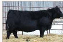
KOP MS TRACKER 189X DAM OF LOT 38

DOUBLE BAR D DRIFTWOOD 83 CG BLACK GENIE 371N WLB MR. NUGGET 132N 355R PERKS NETTY 3N