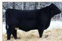
SILVER LAKE FORTRESS 9F DAM OF LOT 37

Opportunity knocks here! Hawkeye is an outstanding heifer bull prospect here! This attention grabbing Night Hawk son comes to you from a first calf heifer that we are