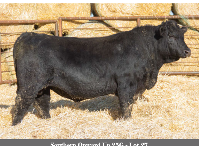
Southern Onward Up 25G - Lot 27

Here is a bull that a lot of ranches would appreciate. He is a son of a bull Dad raised out of Sitz Upward 307. He was a big bull and we never pulled a calf out of him even if they were a bit bigger which wasn't too often. The calves always got up and had good vigor. 25G is sure to pass on some real production cattle that will make the ranch money.