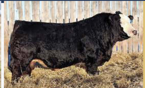
IPU BENTLEY 81F