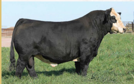
W/C BANKROLL 811D