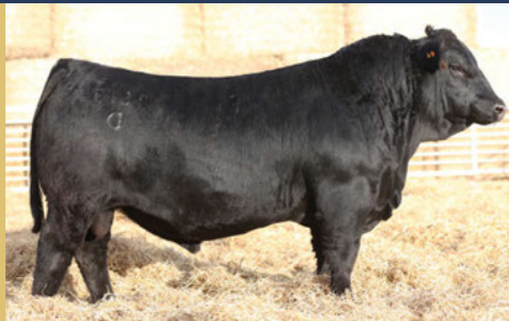
LFE NIGHT HAWK 3013D