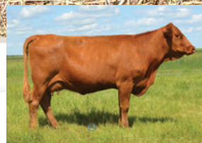
dam: MANDY 170C