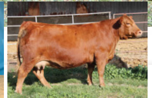
dam: MS DUNNIT 136G