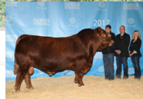
mat grandsire: DUNNIT 25C