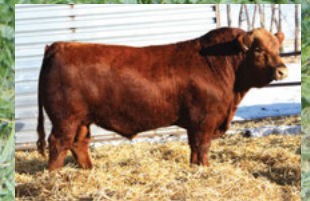
sire: NGC CASANOVA 8C