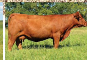
grand dam: BAHA 35B