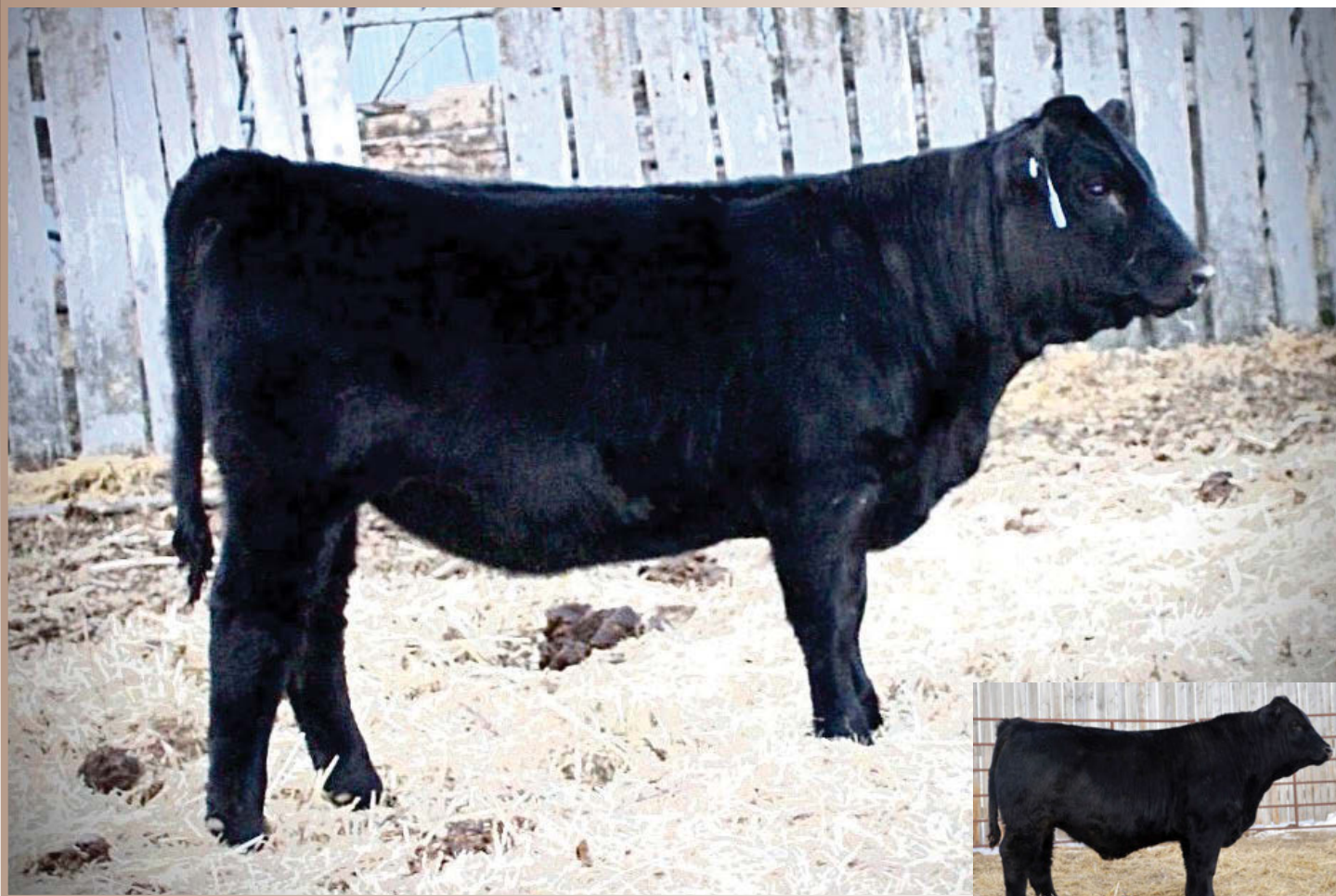
sire: INVICTUS 110G