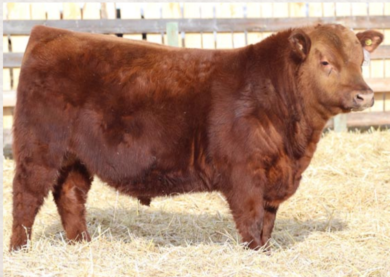
39 DIAMOND T RED DIAMOND T STAUNCH 2091 RED • GDRS 91H • MAR 10 2020 • 2161446

SIRE RED SSS STAUNCH 64Y RED SSS OLY 554T RED SSS SCAARA 429W RED KENRAY STAUNCH 61D RED K F X-RAY 26X RED KENRAY ROSA 3A RED K F ROSA 34W DAM RED U-2 REVENUE 200C RED U-2 RECKONING 149A RED U2 MS CV 373W RED WWF LARKEISA 180F RED SIX MILE SAKIC 832S RED WWF SAKIC LARKEISA 72Y RED WWF MAX LARKEISA 72U