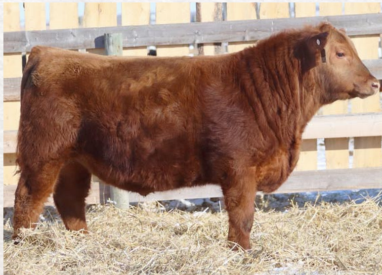
38 DIAMOND T RED DIAMOND T UPROAR 2092 RED • GDRS 92H • MAR 10 2020 • 2161447

SIRE RED U-2 AUTHENTIC 139A RED MINBURN COPENHAGEN 3Y RED U-2 STORMY 7202T RED W SUNRISE AUTHENTIC 104F RED BROWN CREEK ECONOMY 62Z RED BROWN CREEK SUNFLOWER 71C DAM RED SIX MILE HIGH CALIBER 177C RED SIX MILE TAURUS 519A RED U6 ALANA 13X RED DIAMOND T AMBER 1739 -177C RED WILDMAN RIO GRANDE 520R RED DIAMOND T RIO-AMBER 233'07 RED SSS AMBER TOAS 811G